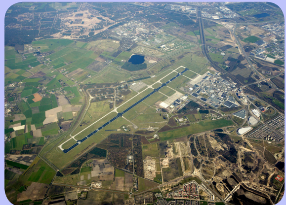
Eindhoven Airbase, the Netherlands