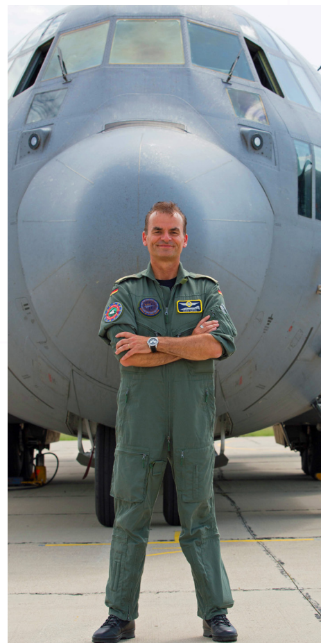
Major General Christian Badia, Commander of the EATC

Italy's accession and TOA have enriched EATC in many ways. Not only does the Italian Air Force contribute with excellent air transport and air-to-air refuelling capabilities, but Italy has also detached outstanding and qualified officers and NCOs to EATC. This personnel is integrated into the multinational staff enriching it by its professionalism and diversity.