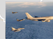
Airbus A310 MRTT