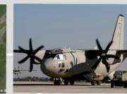
Alenia C-27J Spartan