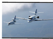
Falcon 900 and 20