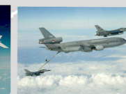
McDonnell Douglas KDC-10